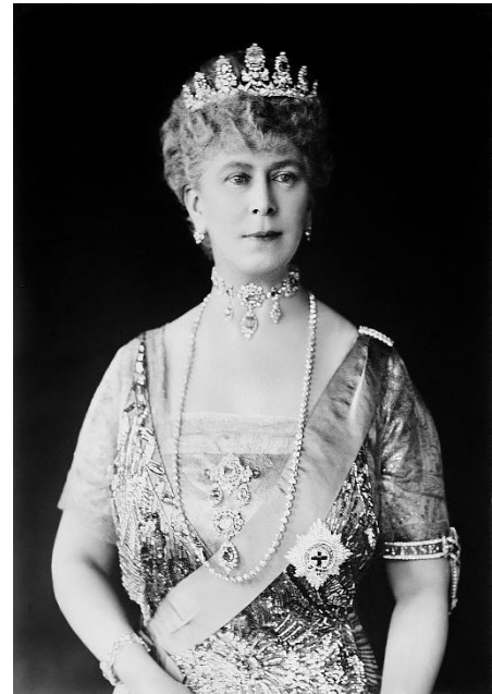
Queen Mary (1867-1954)

Queen Mary (Victoria Mary Augusta Louise Olga Pauline Claudine Agnes of Teck) was born at London in 1867, the daughter of Francis Duke of Teck (1837-1900) and Princess Mary Adelaide of Cambridge (1837-1897). As the wife of King George V (1865-1936), she had been Queen of the United Kingdom and British Dominions and Empress of India from 1910 to 1936. She was the mother of two British Kings; King Edward VIII (1894-1972), who reigned from January 1936 until his abdication that December, and King George VI (1895-1952) who occupied the throne from 1936 until his death in 1952. As such, Mary was also the grandmother of Queen Elizabeth II (1926-2022) and great grandmother of King Charles III (b.1948).