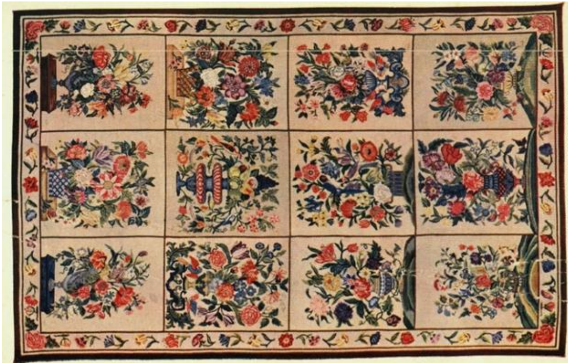
Queen Mary's Dollar Rug

Although many British Queens have been skilled at needlework the 'dollar' rug worked by Queen Mary is probably the largest in size to be completed by one pair of royal hands.