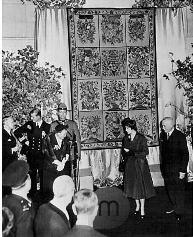
Princess Elizabeth presenting carpet to Canadian History Museum on behalf of the IODE - 1951

Queen Mary died at London 1954. Today, her carpet is in the collection of the Canadian Museum of History (artifact #2017.148.1.2).